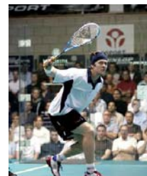
Squash: Jonathon Power, Lee Beachill, Sarah Fitz-Gerald