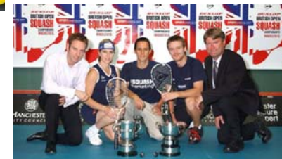
Dunlop British Open Squash Championships