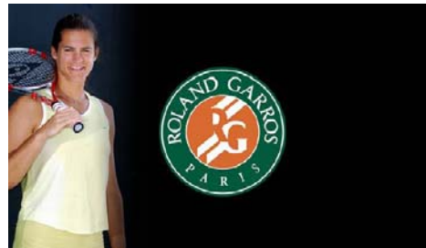
Roland Garros – French Open